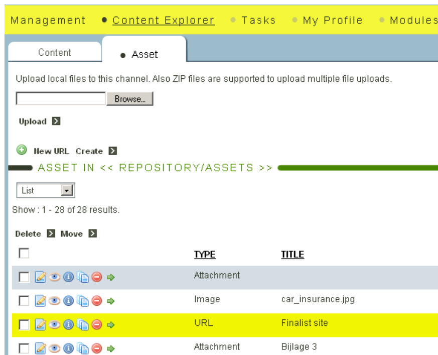
Illustration 1: Channel view, where the Assets are displayed.

The most significant new feature in the 1.6 release is the Assets functionality. That means that, simply put, all attachments, images and URLs are stored into a channel or map. Before the Assets implementation, all images, attachments and URLs were stored in a separate space. Before 1.6, they were all jammed in the same channel, where the same access rights applied. Currently, the rights on an asset depends on the rights in the containing channel.